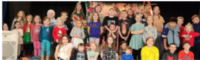
Caroling before the Torchlight Parade & celebrating a Czech Christmas at the Revival on Main.

Tune into KCHK Radio (1350 AM - 95.5 FM) on Friday morning, Dec. 22. The Singing Angels will perform first, so get up bright & early (6:30/7:00).